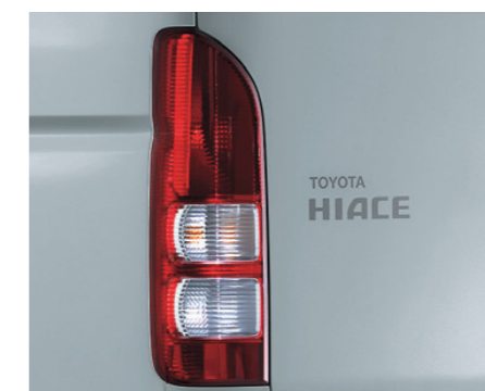
Silver Mica Metallic (1E7)